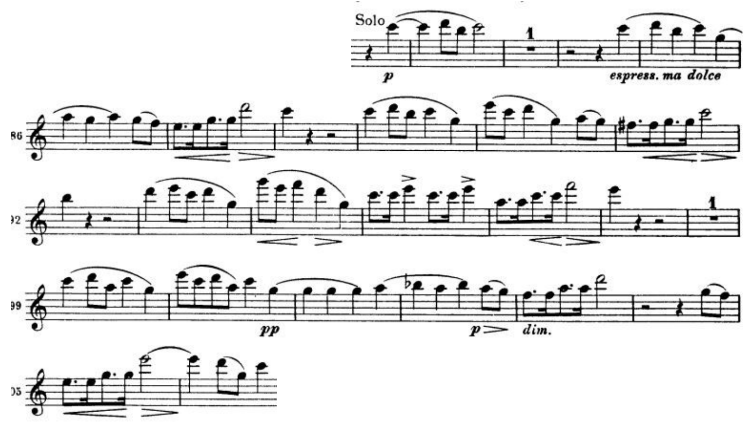
Excerpt #2– Vaughan Williams Folk Song Suite, Mvmt. 2 (J=72)