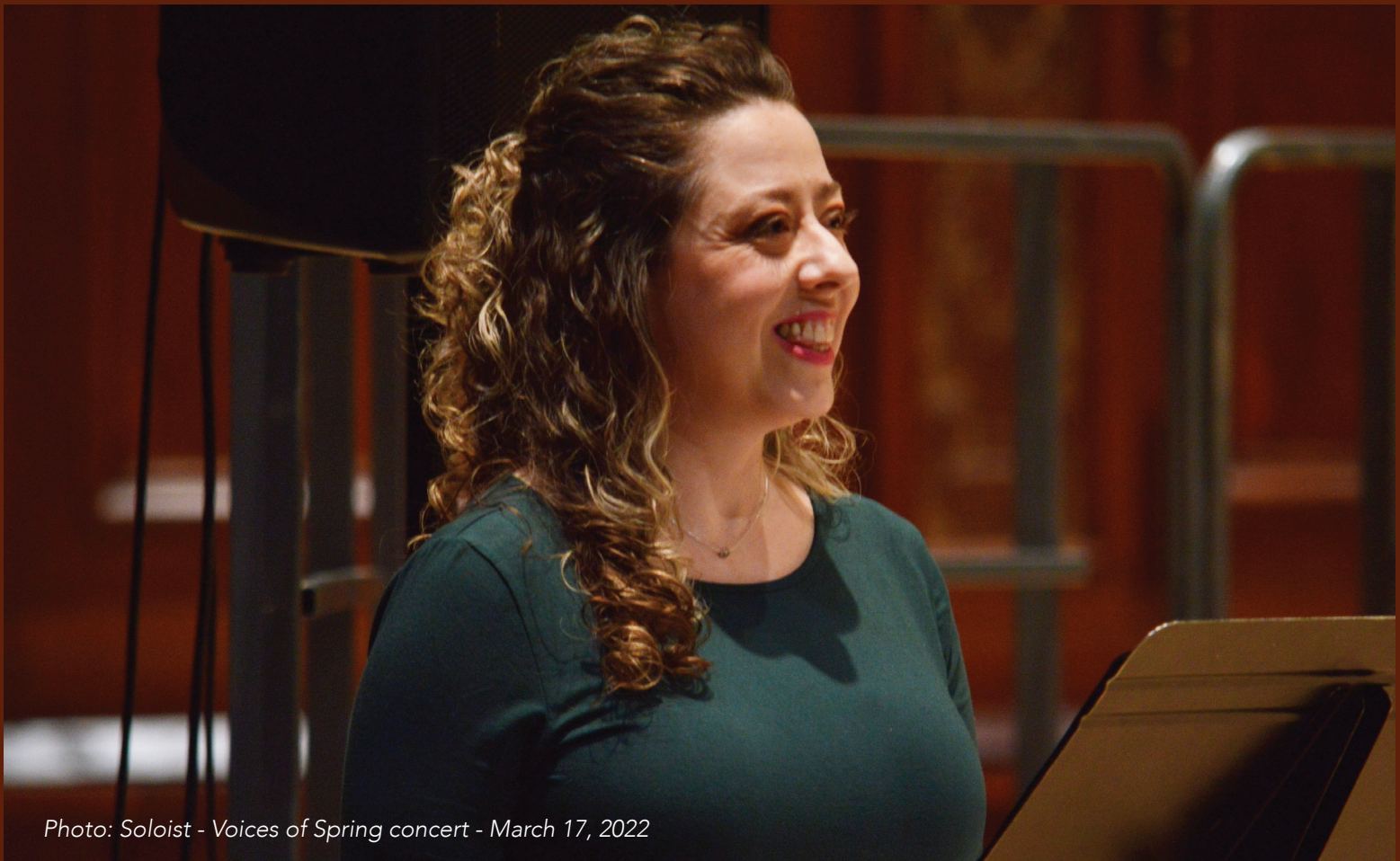
Photo: Soloist - Voices of Spring concert - March 17, 2022