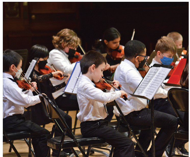
Photo: Hochstein Concertino Strings, March 6, 2022