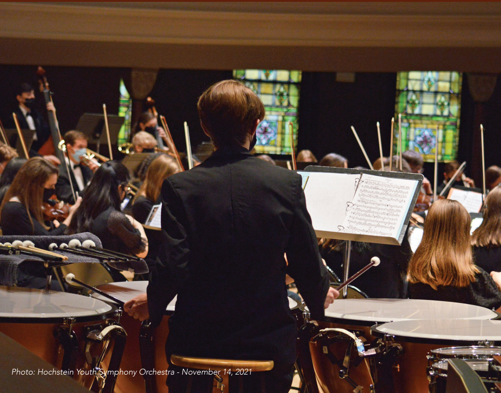
Photo: Hochstein Youth Symphony Orchestra - November 14, 2021