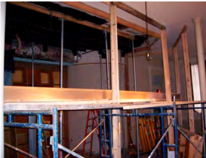
Recital Hall under repair

May is construction season at Hochstein! Along with the Phase 1 of the planned transformation of our former library into a nine-station Computer Lab, came the unanticipated need to replace the entire ceiling in the Recital Hall! We expect to reopen the Hall in just a few weeks, but meanwhile we're enjoying recitals in the Performance Hall, Chapel, and other spaces at Hochstein and Downtown Church. The Computer Lab is slated to open this summer when we will begin to offer exciting opportunities for ear training, composing, arranging, and much more!