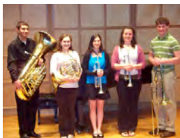
Scholarship Brass Quintet performed with Chamber