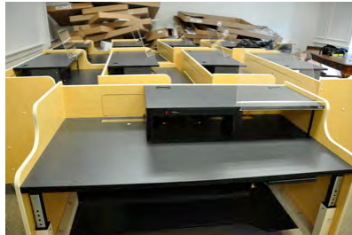
One of the new computer workstations for our Music Lab