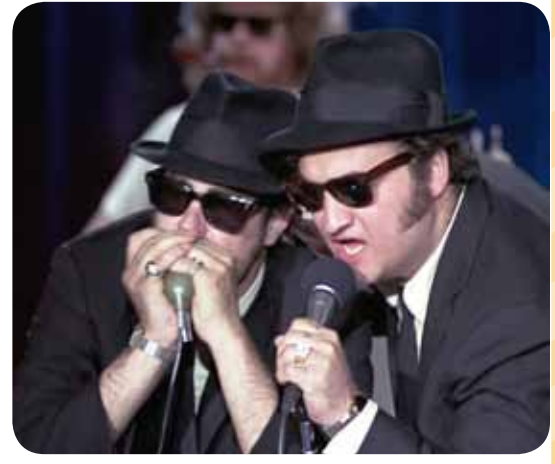
The #1 reason to learn harmonica: these cool cats!

Fee: $10 registration fee; $64* tuition; $48 if enrolled in individual lessons at Hochstein.