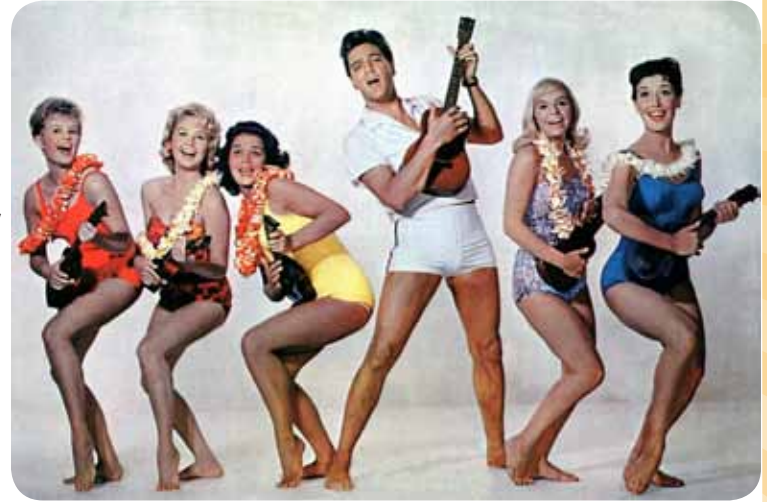
This is actually how cool you would be if you started playing the ukulele!;)

Fee: $10 registration fee; $96* tuition; $72 if enrolled in individual lessons at Hochstein.